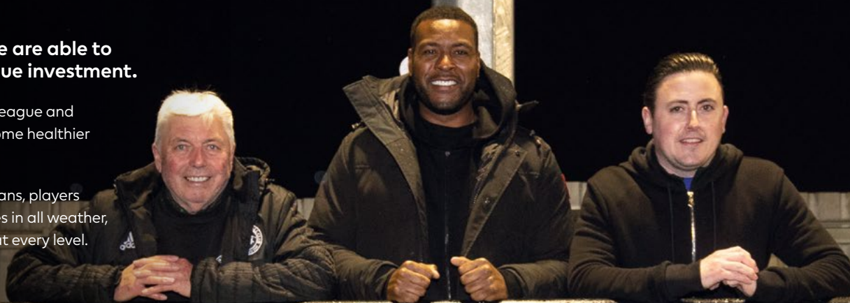
Premier League Champion Wes Morgan visited his former club, Dunkirk FC, to see how Premier League funding has supported the development of their stadium

We are investing in better spaces for fans, players and officials. Hardier pitches for games in all weather, and a better matchday for everyone at every level.